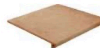
IMPALA | PELDAÑO FIORENTINO ANTI-SLIP *Peldaño extrusionado | Extrusive step